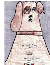
The Sad Dog